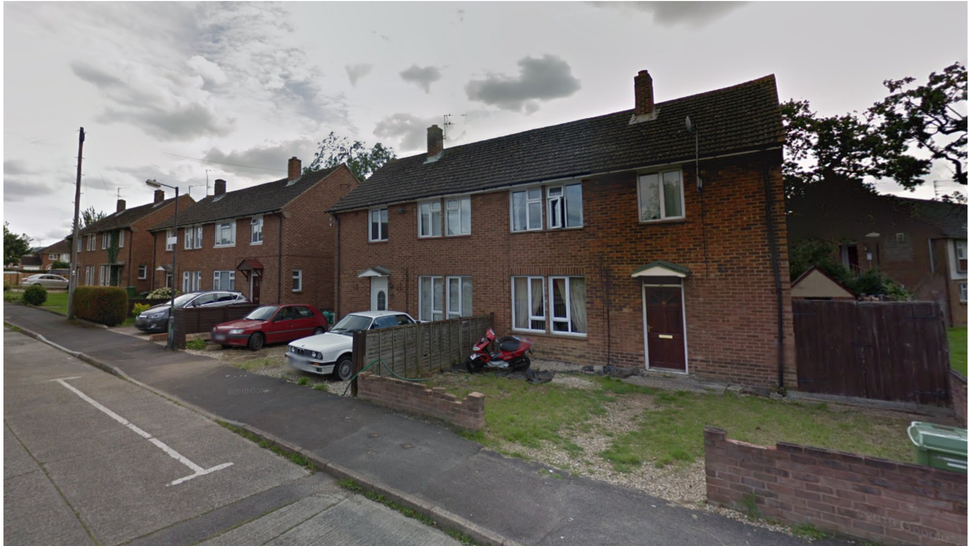
Application site properties in Dinas Road