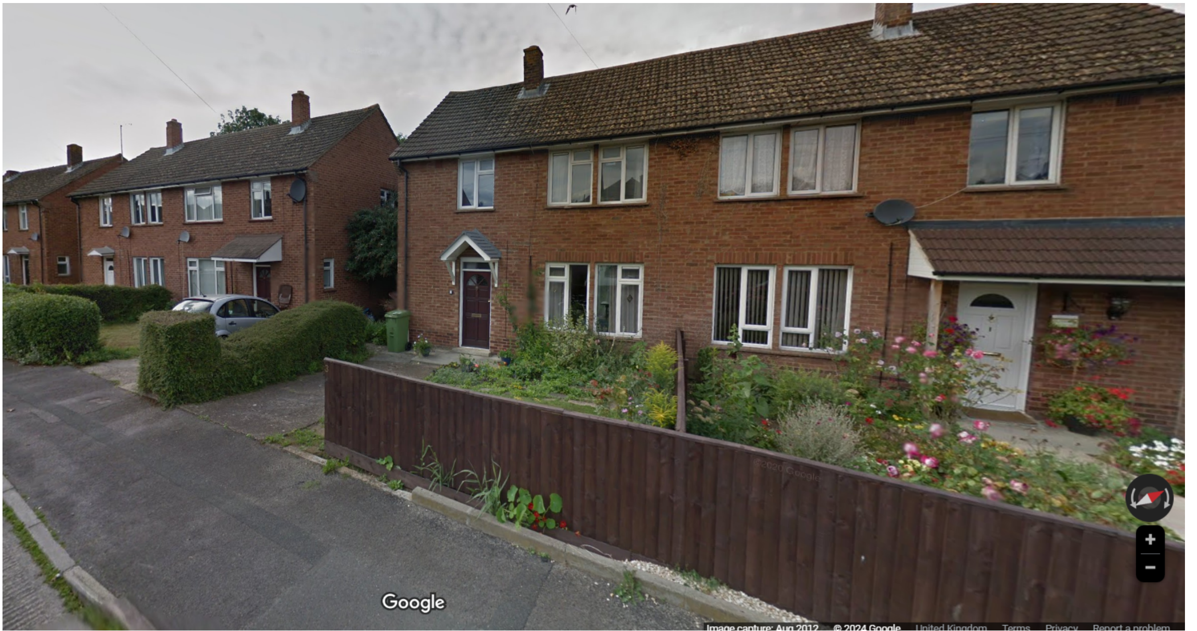
Application site properties in Dinas Road