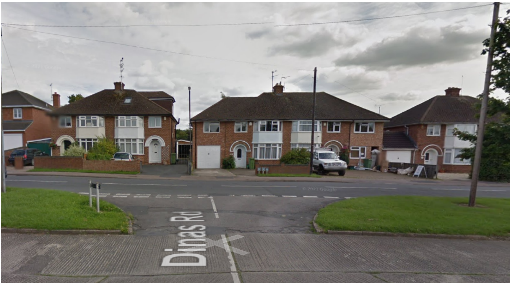
Local context photos - Properties in Warden Hill Road