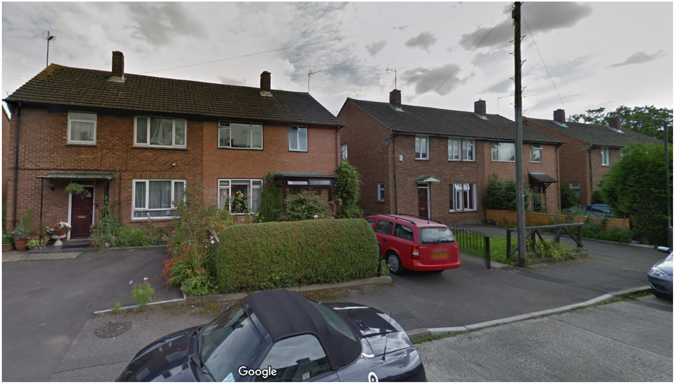
Application site properties in Dinas Road