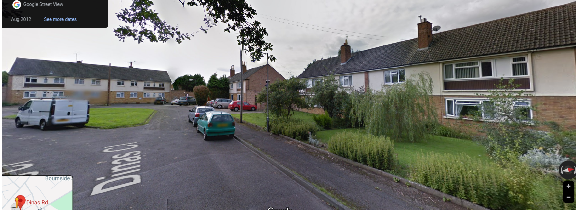
Local context photos - Properties in Dinas Close